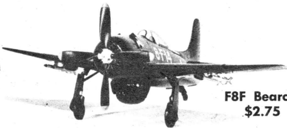
F8F Bearcat $2.75

Every little detail visible in the actual airplane, every single item that can be reproduced is given to you.