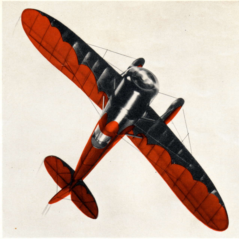
Span, 22"; length 15 \frac{1}{4} ". Colored: A Brilliant Red and Black.

"Since I read the new Cleveland catalog, I have flung out all the rest, and am going to do business with a dependable company that can produce the most realistic scale models I've ever seen."