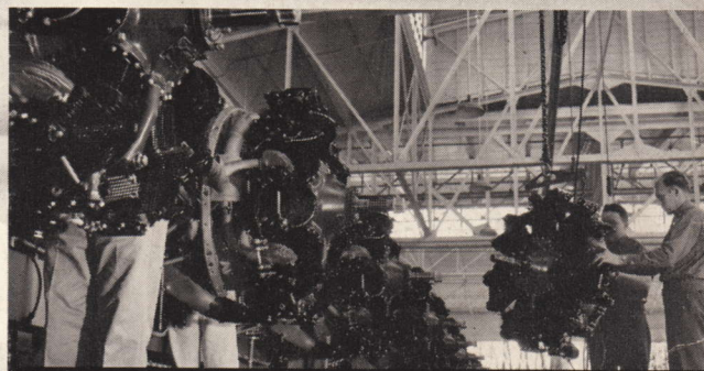
ALONG THE ENGINE LINE WHERE POWER PLANTS ARE PREPARED FOR INSTALLATION IN STEARMAN TRAINERS

Seattle, Washington Wichita, Kansas Vancouver, B. C.