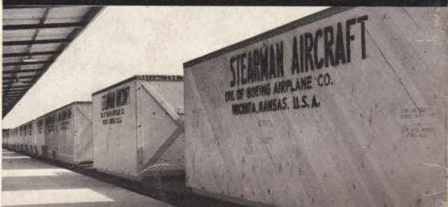
A RECENT SHIPMENT OF STEARMAN TRAINERS LEAVING THE PLANT EN ROUTE TO THE PHILIPPINES