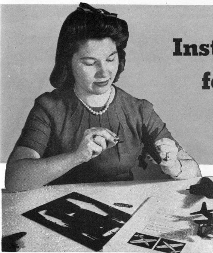
Many happy and useful hours are spent in the fascinating hobby—aircraft recognition. An outstanding aid to spotters in helping to perfect their ability to spot planes is the assembling of three dimensional silhouette models shown in the photograph above.

The latest and perhaps the most interesting aid to recognition students and hobbyists is a series of fifty different three-dimensional silhouette models pressed in black cardboard and giving the appearance, before assembly, of jig saw puzzles. These models, used officially by the Army Air Forces, may be assembled by individuals or by recognition clubs and study groups.