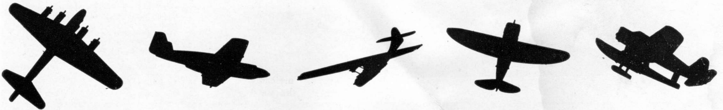
Enhanced value of working with three dimensional cardboard silhouette models is illustrated in this series of photographs showing five of the fifty models from various angles. Made exactly to scale, the assembled models may be suspended in various positions to give accurate views of aircraft as if in flight.

Copies of Recognition Manuals shown at the bottom of the page are also great aids to spotters who wish to become perfect in their fascinating, wartime hobby. In addition, large silhouette posters showing aircraft of all nations in orthographic projections, may be secured. All recognition material described here is available through the respective Wing and Region offices.